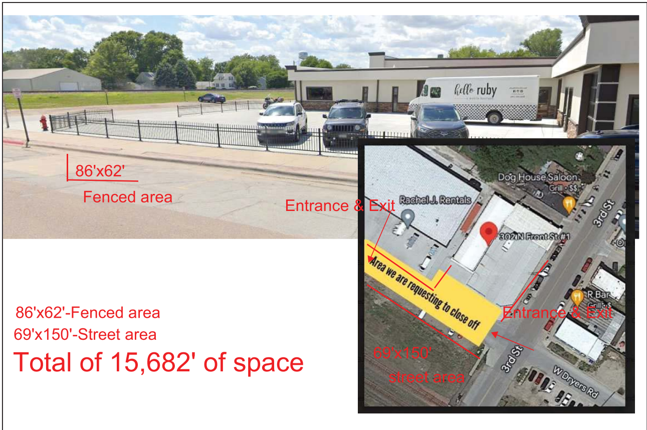
DIAGRAM OF PROPOSED AREA: